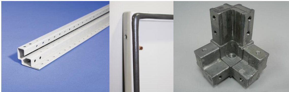
Frame, gasket and corner joints – engineered for strength and reliability