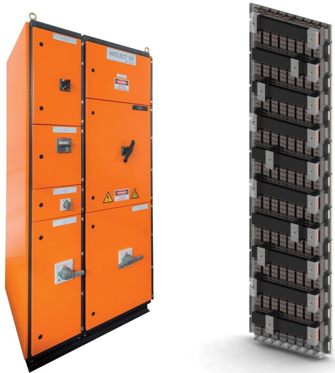
iNTELECT™G3 switchboard casing and busbar system

The iNTELECT G3 Switchboard System is a custom-modular switchboard system that has been the subject of ongoing continuous development for more than 30 years.